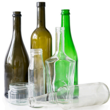
Bottles & Jars