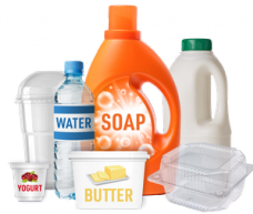
Bottles, Tubs, & Jugs