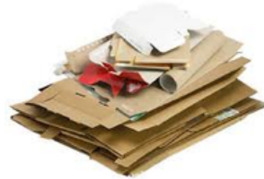
Mixed Paper, Newspaper, Magazines, Boxes