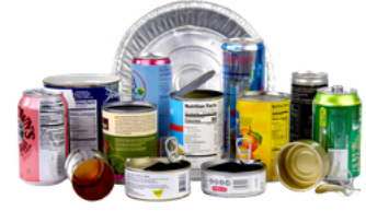
Food and Beverage Cans

Empty & rinse containers • Keep items dry • No trash or yard waste • Flatten boxes