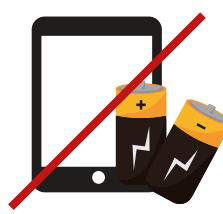
Batteries & Electronics